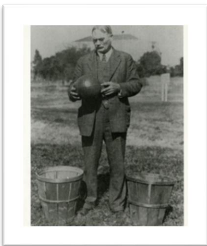
James Naismith invented the game of basketball at the International YMCA training school in Springfield, Massachusetts in 1890.

For nearly six decades, the Russell Gym has been the center of indoor life at the Y, welcoming generations of children, teens, families, schools, musicians, and community partners. Now, there is an opportunity to restore the Russell Gym to serve the next generation.