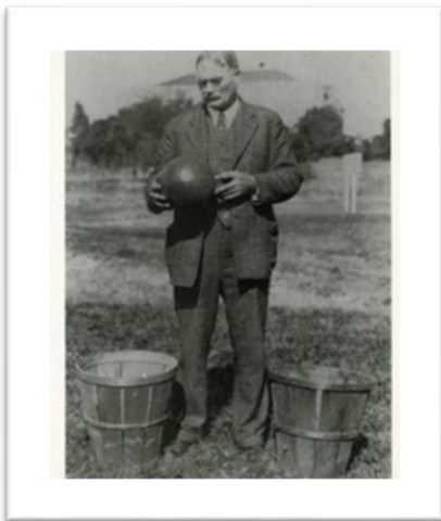
James Naismith invented the game of basketball at the International YMCA training school in Springfield, Massachusetts in 1890.

For nearly six decades, the Russell Gym has been the center of indoor life at the Y, welcoming generations of children, teens, families, schools, musicians, and community partners. Now, there is an opportunity to restore the Russell Gym to serve the next generation.